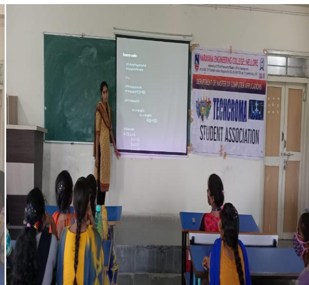
Student Coordinators are explaining Coding tips to the students