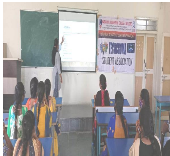
Student Coordinators are explaining Hands on Code Logics